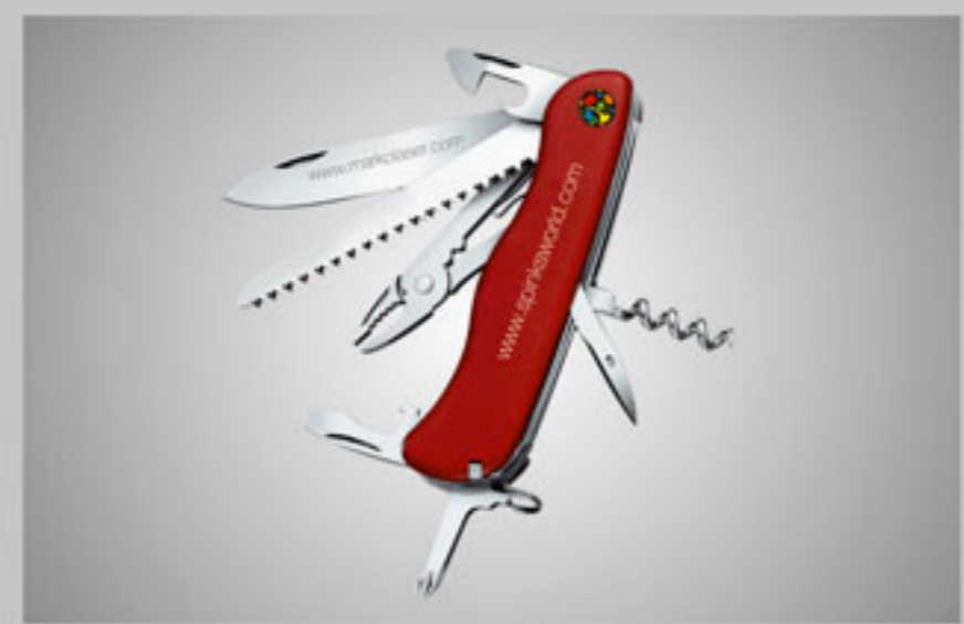
Customization on gift items