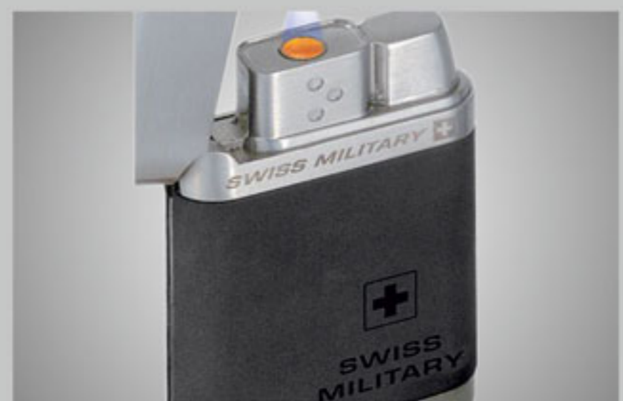
Marking on coated SS