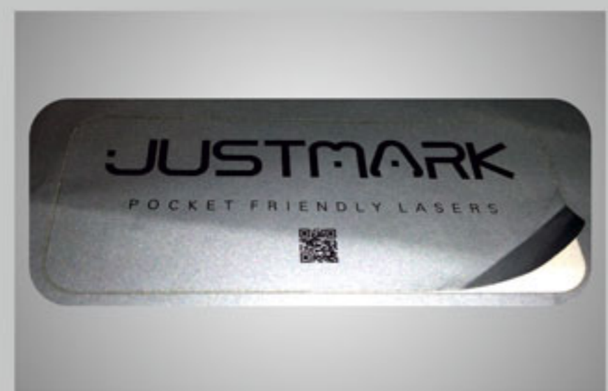
Marking & cutting of 3m stickers