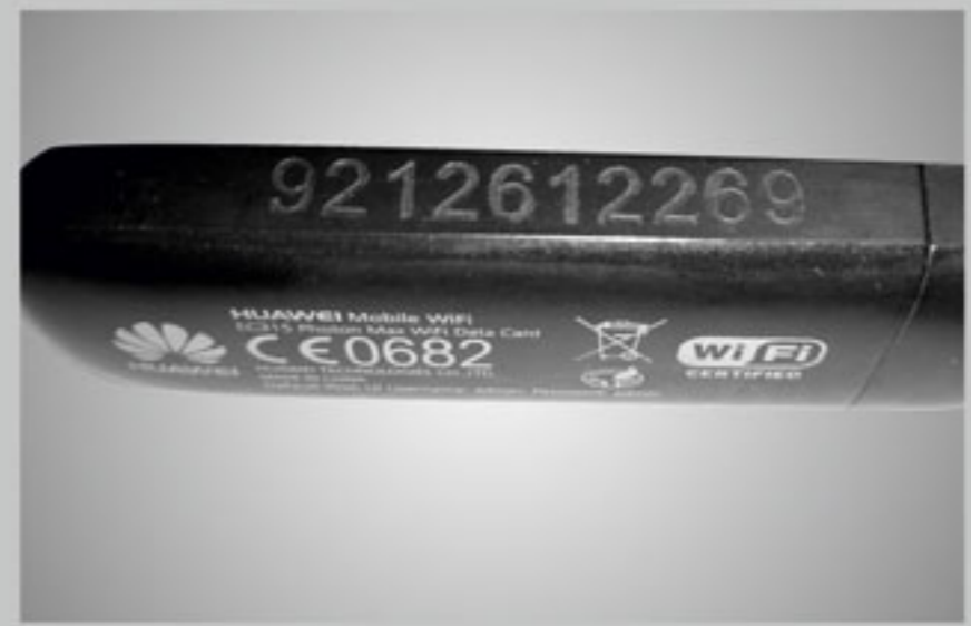
Marking on plastics