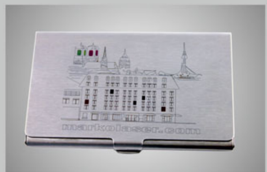
Marking on high grade SS