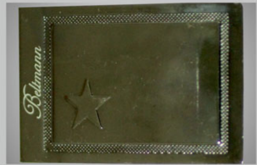
Marking on belt buckles