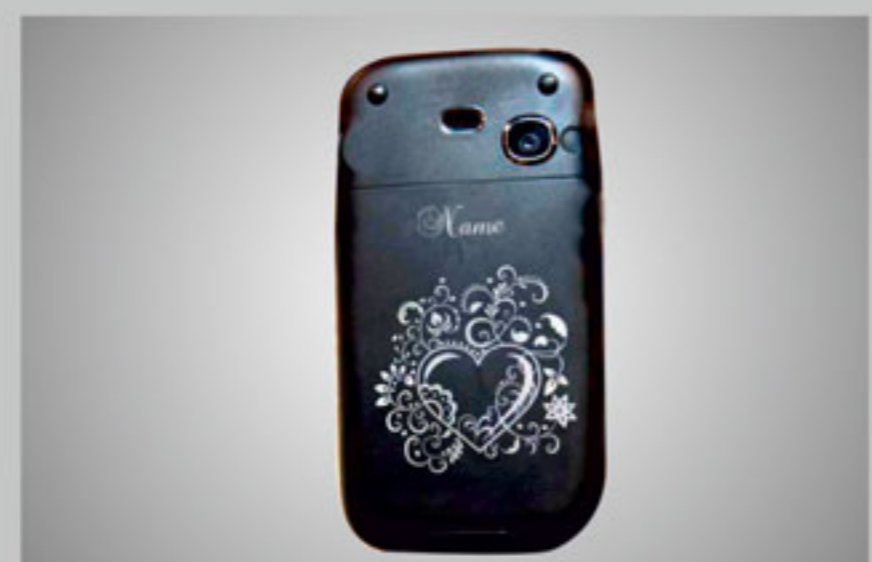
Marking on mobile case